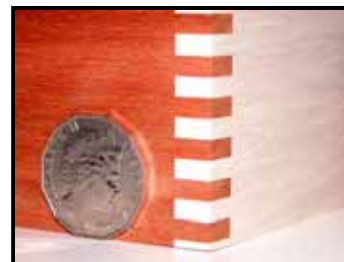
5 mm finger joint in 10 mm timber