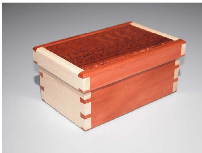
Loose Lidded Box

This DVD shows construction of the “Loose Lidded Box” from the Dovetailed Boxes plans. Whilst a fairly simple design, great care is needed to do this project well. The DVD is packed with tips and hints to get the most out of the processes involved. Seeing the fence setups and router table techniques is a must for producing a great finished product!