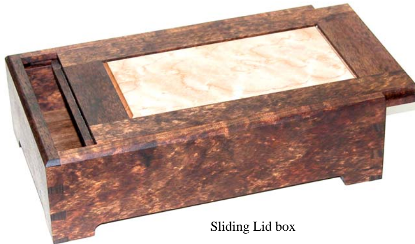
Sliding Lid box